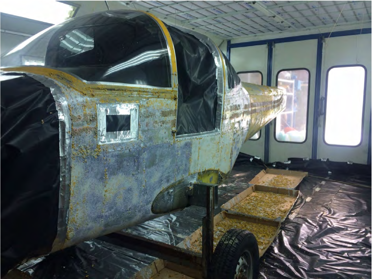
3. Fuselage stripped back to bare metal.