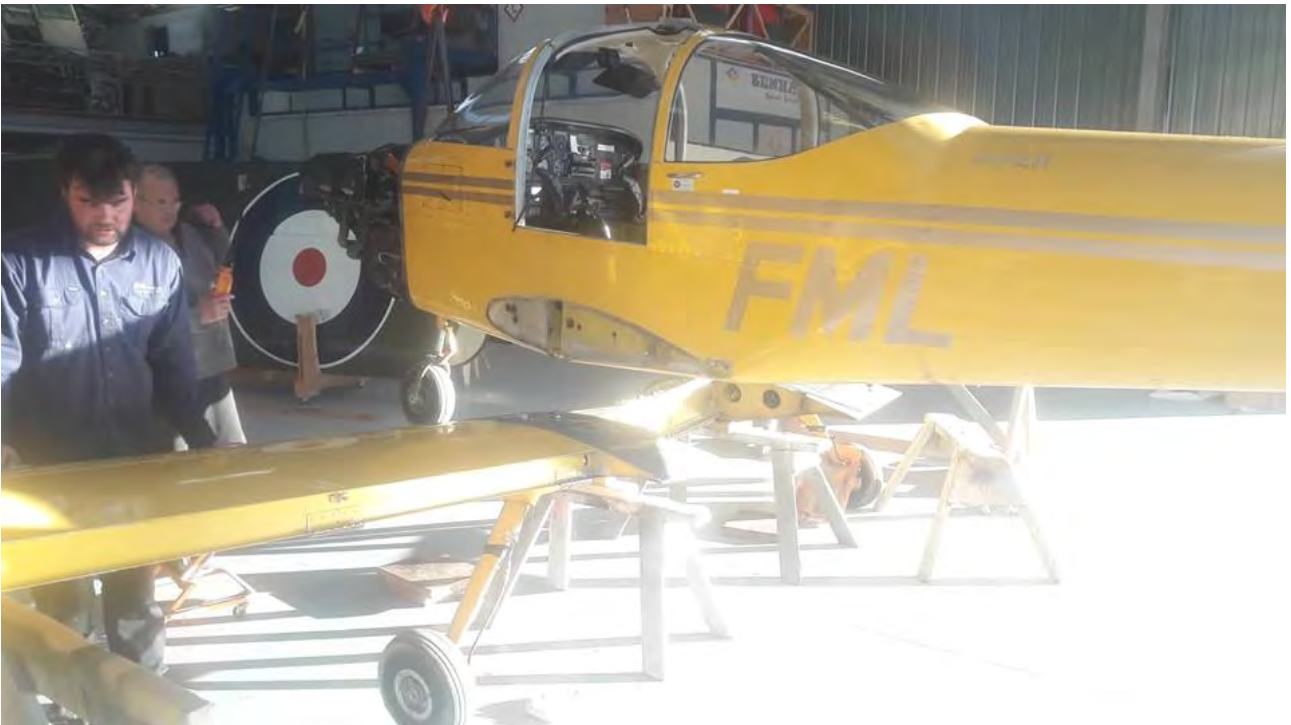
2. Disassembly begins.