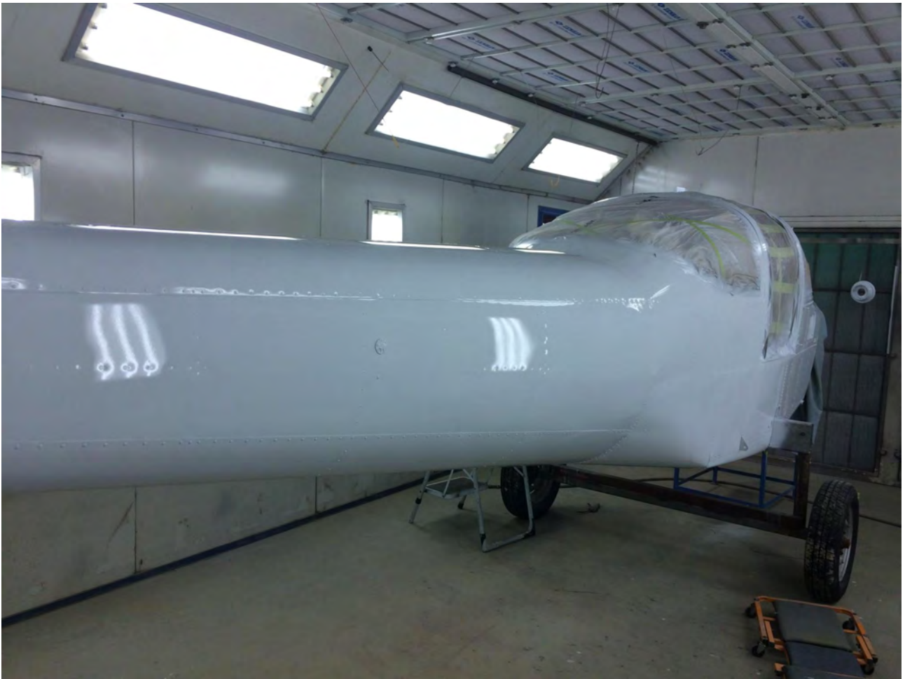
5. The fuselage is primarily “Frozen White”, with bold panels of yellow.