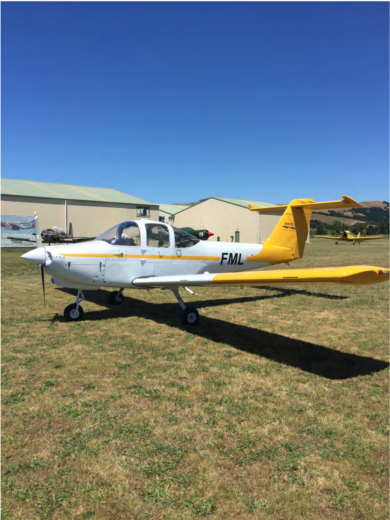
7. FML resplendent on a fantastic day for its first test flight. Jay and his team have done a fantastic job, under no small time pressure.