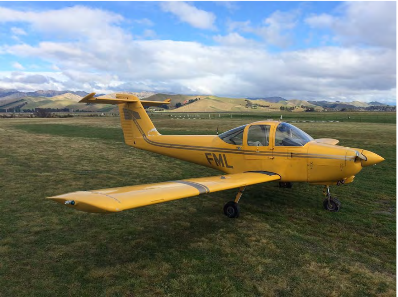
1. FLM When purchased in June 2018.