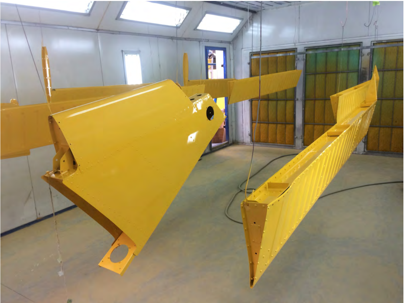
4. Yellow on the control surfaces.